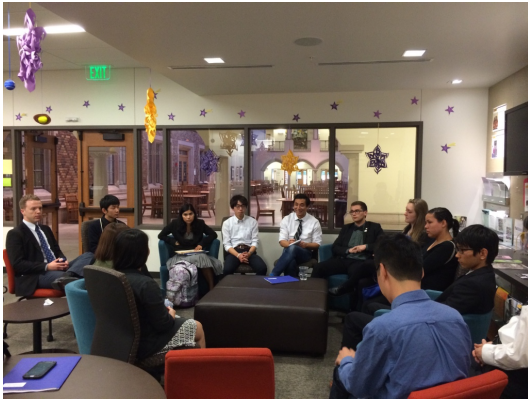
Debriefing after the Child Welfare Learning Collaborative at UW