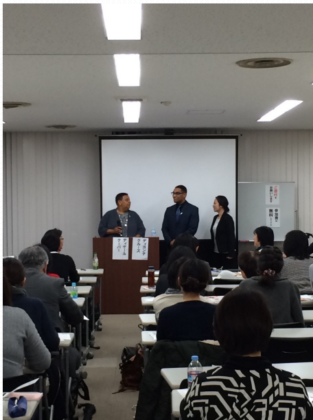
Seminar in Tokyo