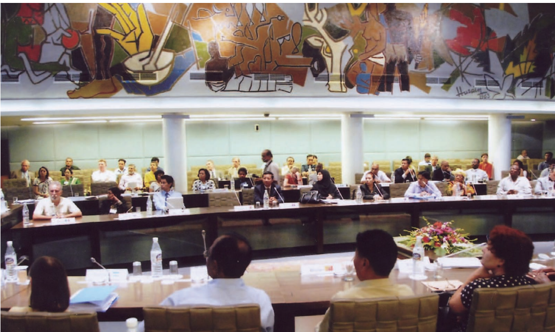
The three-day meeting at WHO SEARO in New Delhi achieved consensus on leprosy control strategy for 2011-2015.