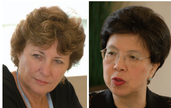
Dr. Mirta Roses

On May 22, the Goodwill Ambassador met with Dr. Navanethem Pillay, UN High Commissioner for Human Rights, when he explained the background to his efforts to bring leprosy to the attention of UN human rights experts. Dr. Pillay, who was appointed last September, expressed surprise that leprosy had not been taken up as a human rights issue in the past. She commended the Goodwill Ambassador's continuous efforts to draw attention to the issue and acknowledged the initiative taken by the Japanese government in overseeing the passage of resolution 8/13. She said she looked forward to the report that the HRC Advisory Committee was preparing on leprosy and human rights, and promised that her office would remain fully focused on the issue. ■