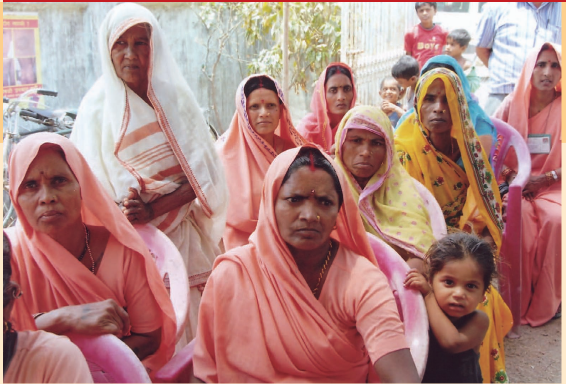
Devpura subhealth post near Janakpur, Danusha district