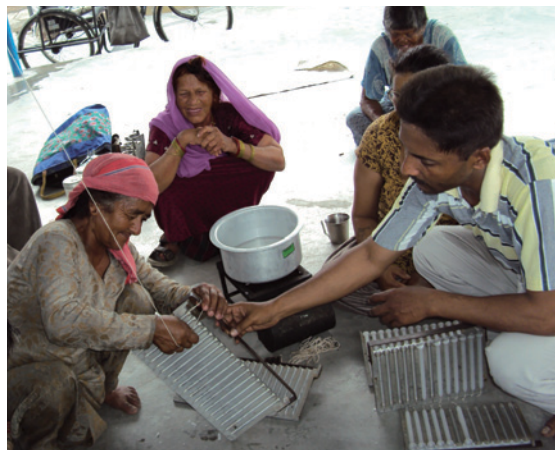
Skills training at Kusth Ashram Viklang Sahayata in Dehradun, Uttarakhand