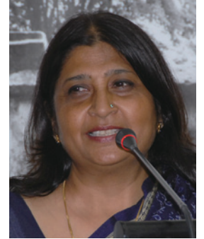
Executive Director Sasakawa-India Leprosy Foundation