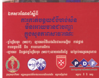
Booklet on leprosy

health systems by empowering people with the knowledge to access diagnosis and treatment of leprosy. Strategies to achieve this include factory visits.