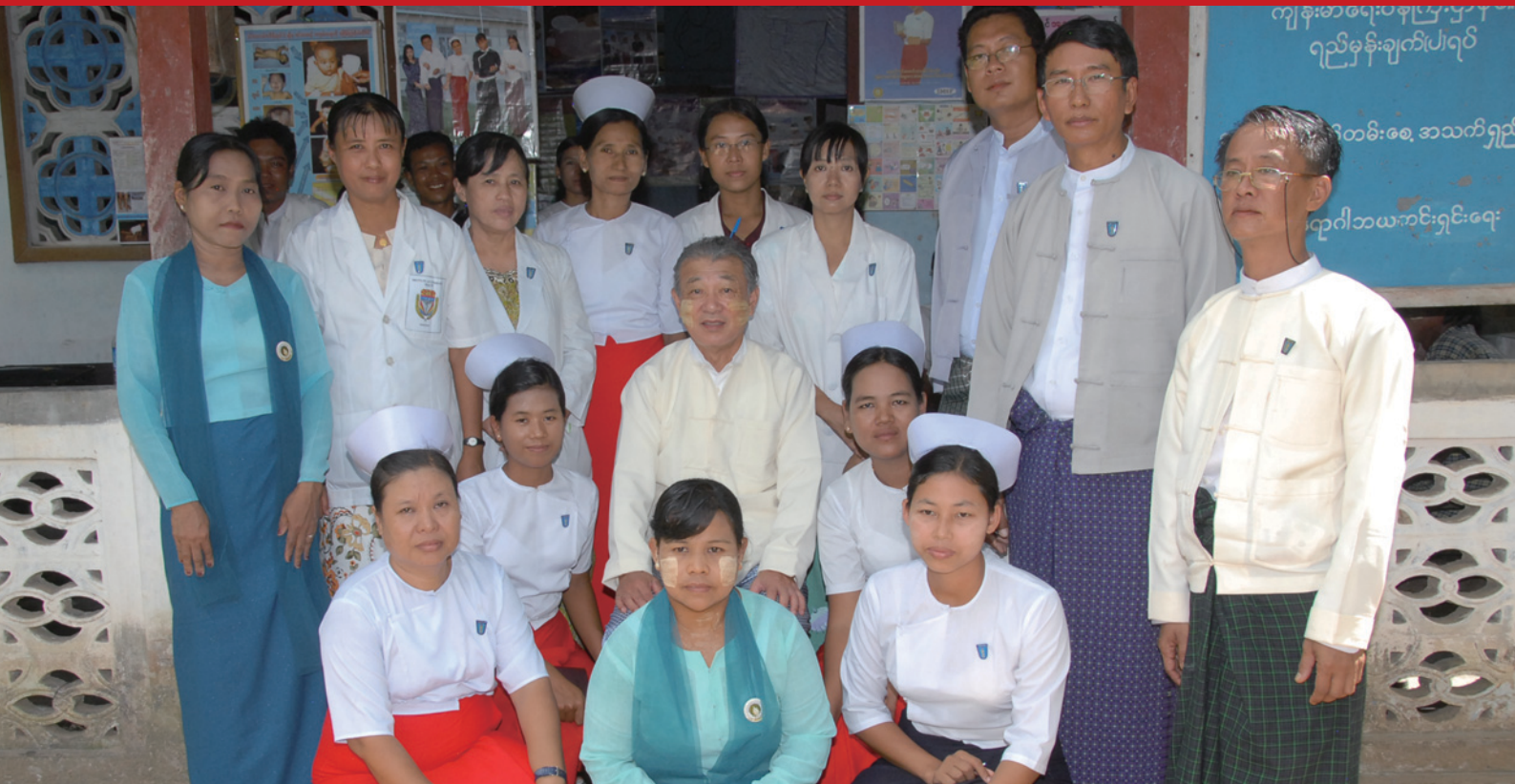
The Goodwill Ambassador (center) with staff of Kyun Kone Rural Health Center in Myanmar's Bago division on October 25.