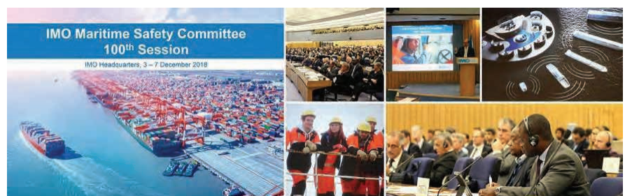
The song written by IMLA was presented at IMO MSC 100

To celebrate the International Day of Seafarers and honor seafarers for the dedication and professionalism they have displayed over the course of the pandemic, IMLA joined the round table online discussion on "Seafarers Day 2020 – Challenges and New Opportunities" which was organized by Batumi Navigation Teaching University on June 25, 2020, to discuss the challenges and new opportunities facing the maritime sector.