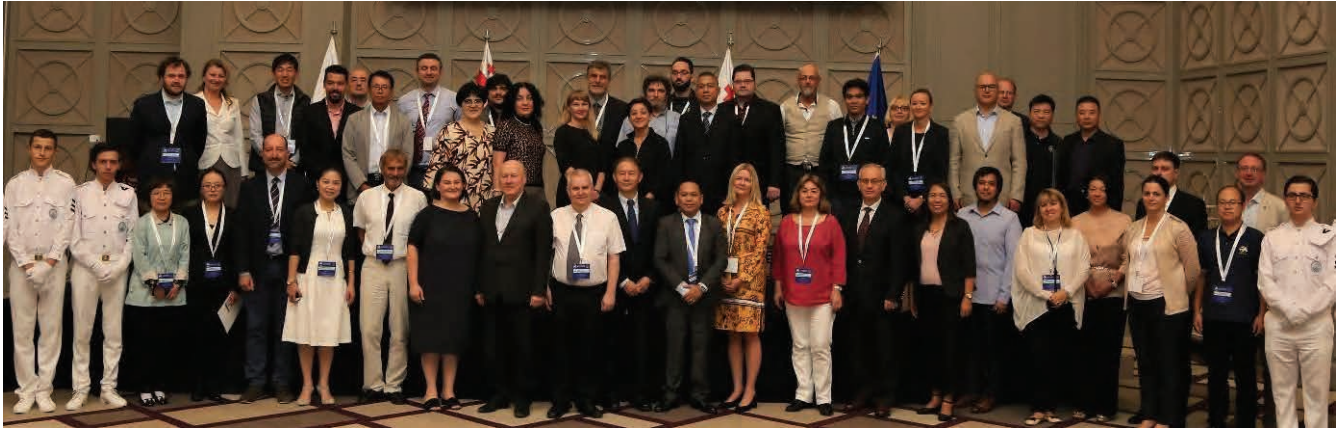
2019 IMLA Annual Conference, Batumi, Georgia