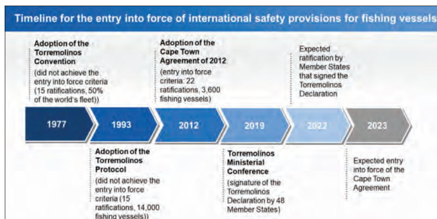
IMO's expected timeline for the entry into force of the Agreement (document A 31/10/3, annex 4)