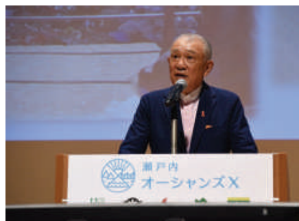
Remarks from Chairman Sasakawa at the launching of SETOUCHI OCEANS X

the SETOUCHI OCEANS X project with the aim of tackling the problem of maritime debris and presenting the world with a model for resolving this issue. An MOU has been concluded among the governors of the four prefectures sitting on the Seto Inland Sea (Hiroshima, Okayama, Kagawa, and Ehime) and The Nippon Foundation Chairman, Yohei Sasakawa, and four initiatives (survey research, coordination with businesses and local communities, enlightenment/education/action, and policy formation) are being undertaken under a five-year plan.