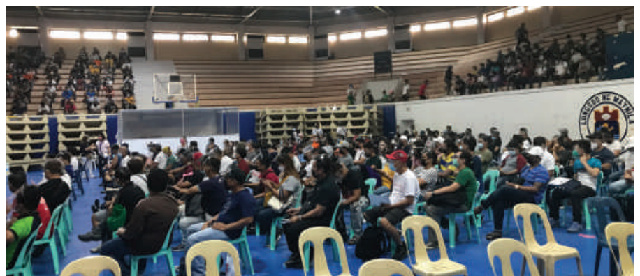
Seafarers and their families waiting to receive their COVID-19 vaccines in Manila.

Lastly, I hope readers of this article are in good health and staying safe from COVID-19.