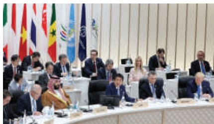
2019 G20 Osaka Summit

Thanks to these efforts, the problem of marine plastic debris became an issue recognized on the international political stage as well. The Leaders' Declaration G7 Summit 2015 specified reductions in waste being discharged from the land into the ocean. 2 At the G20 Osaka Summit in 2019, participants shared the "Osaka Blue Ocean