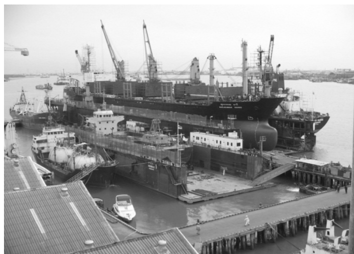
図 22 No.1 フローティングドック