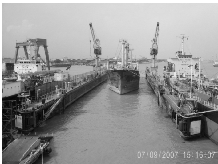
図 23 No.2 フローティングドック