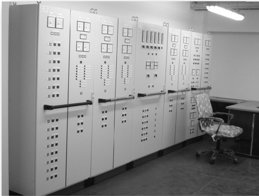
図 20 機関シミュレーター