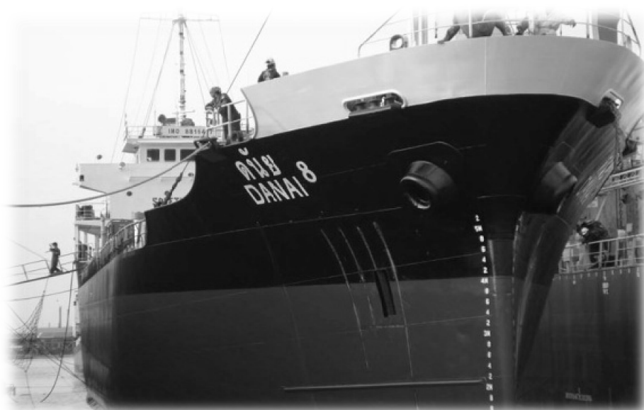
図 26 タンカー改造