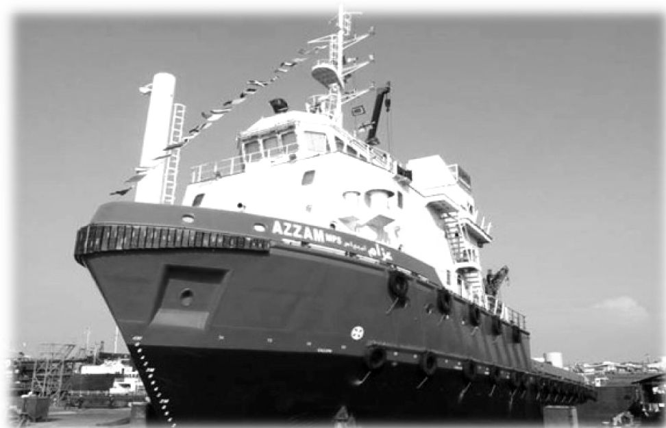
図 25 50m サプライボート