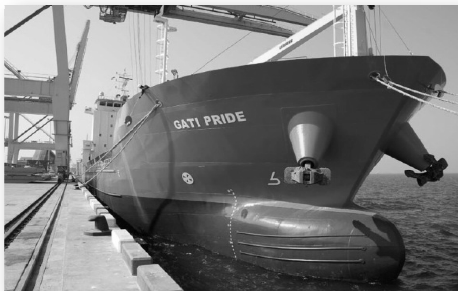
図 24 442TEU コンテナ船