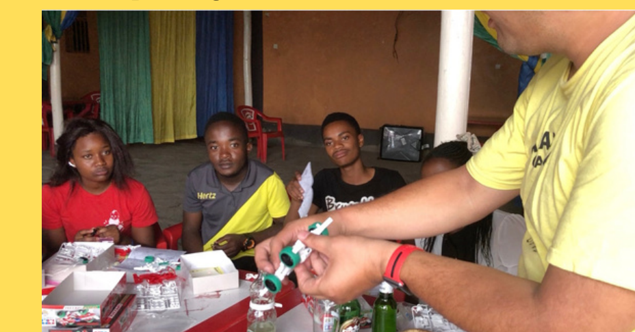
Car craft lesson for child soldiers with TAMIYA INC