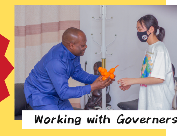
Working with Governors