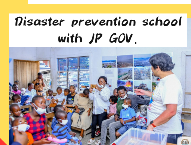
Disaster prevention school with JP GOV.