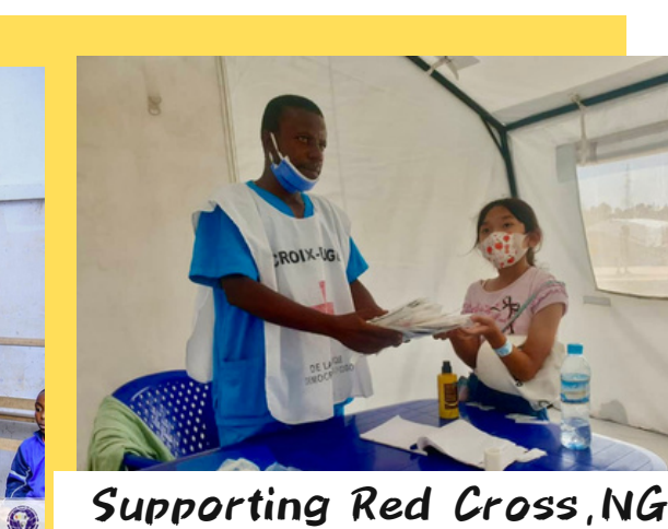
Supporting Red Cross, NGO