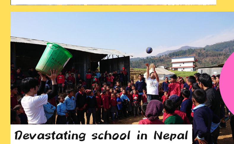
Devastating school in Nepal