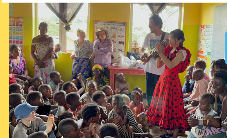
RWAMWANJA refugee camp in Uganda