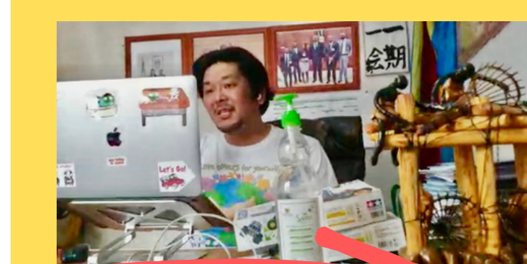
ISSUES EDUCATION ACTION

Information about our works gives chances to think about the "REAL ISSUES".